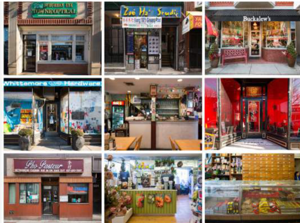
Student Photo Submissions for "Images of Urban Health" contest

For more information about NU-PEL, visit our website at: