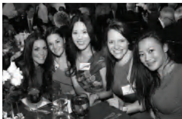
Alumnae and CVS employees enjoy the Grand Celebration.